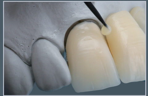
Approximal and cervical for adding on