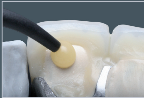
Palatal/lingual for free modelling