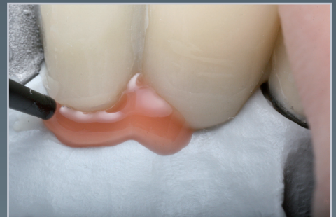
...and red-white esthetics